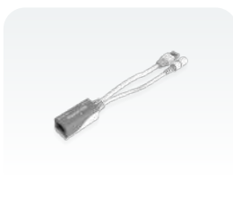
Gigabit PoE injector