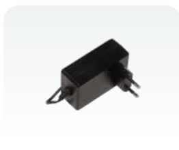
48 V 0.95 A power adapter