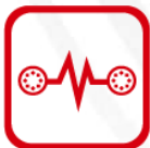
8-Core Power Supply