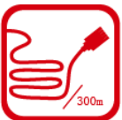
300 m Transmission