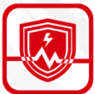
6 KV Surge Protection