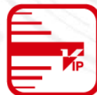
High Priority Ports