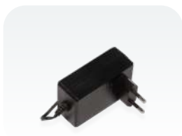
48 V 0.95 A power adapter