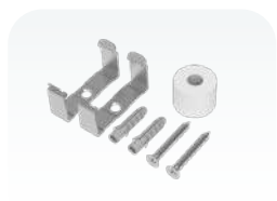
Fastening set (GESP)