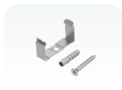
Fastening set (GESP+POE-IN)