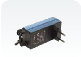
24 V 1.5 A power adapter