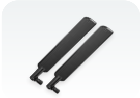
HGO indoor antenna kit