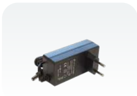
24V 1.5A power adapter