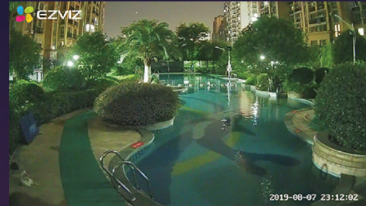
C3X Night Vision*

Leveraging supplemental lights to achieve color night vision was brilliant – until the introduction of the C3X. The C3X uses dual lenses and dual infrared lights to render better color images even in the lowest light conditions. There's no need for spotlights. C3X's colors are more natural, and the image is more evenly-illuminated.