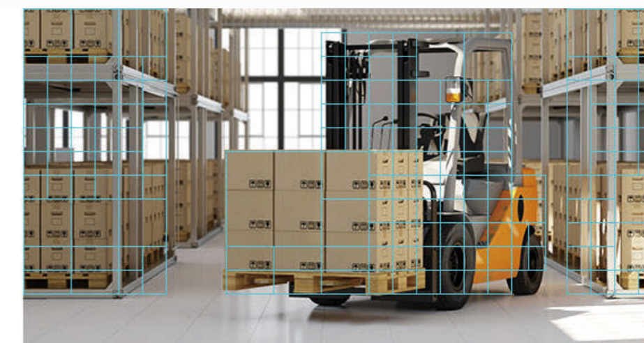
H.265 (Upgraded Video Compression)