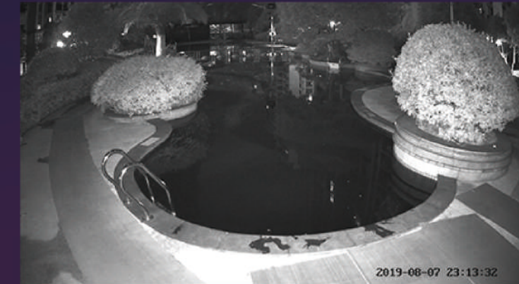
Traditional Black/White Vision

*In extreme environments, such as a completely enclosed warehouse or rural areas in a moonless cloudy night, the C3X will shift to black/white mode to ensure utmost image clarity.