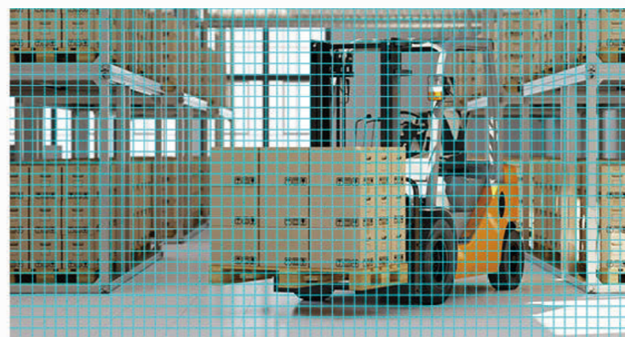
H.264 (Mainstream Video Compression)

Using the latest H.265 video compression technology, the C3X renders clearer and smoother video while reducing the need for data storage space and bandwidth.