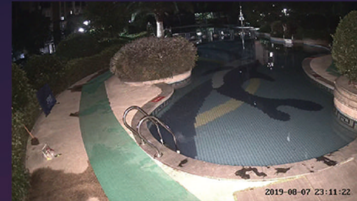
Night Vision with Built-in LEDs