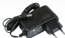
24 V 0.38 A power adapter