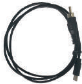
Video output cable (x1)