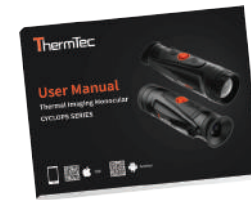
User manual (x1)