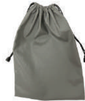
Carry bag (x1)