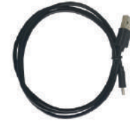
USB cable (x1)