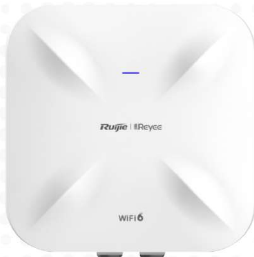
Figure 1-1 RG-RAP6260(G)