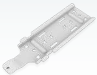
wAP ceiling mount bracket