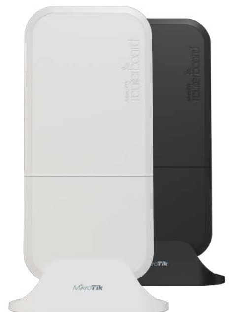
Available in two colors

With the new revision, we have significantly improved the thermal properties of the enclosure – you don't have to worry about any overheating!