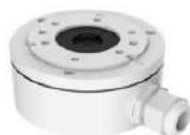
DS-1280ZJ-XS Junction Box