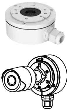
DS-1280ZJ-XS Junction Box