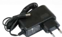
24 V 0.38 A power adapter